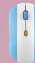
Lenovo 350 Bluetooth Silent Mouse (Fan Edition - Argentina) GY51U71763