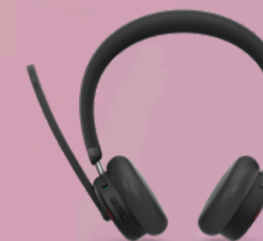
Lenovo Dual-Mode Wireless ANC Headset 6550 (USB-C, Teams) 4XD1S19778