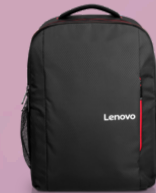
Lenovo 15.6 Laptop Everyday Backpack B510-ROW 4X41U80414